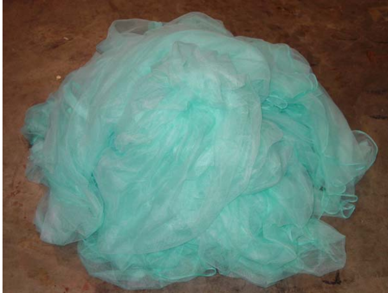
Figure 5. Five (5) nets treated with tint over a 5 minute time period and then allowed to tumble for an additional 15 minutes (note the consistency of color between the nets).

As shown in Table II, wet pick-up of the nets averaged 49.3%, and the standard deviation of net-to-net wet pick-up was quite low.