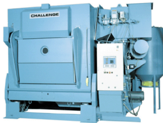
Figure 2. Washex Challenge CPG 600 industrial dryer.

After the chemical application process is complete, the treated nets are transported from the washer/extractor to an industrial gas fired or steam heated dryer such as the Washex Challenge CPG 600 shown in Figure 2. Net transportation options range from manual carts and overhead sling systems to fully automated conveyor handling systems.