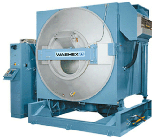
Figure 1. Washex DPM 5000 end-loading washer/extractor.

After the chemical application process is complete, the treated nets are transported from the washer/extractor to an industrial gas fired or steam heated dryer such as the Washex Challenge CPG 600 shown in Figure 2. Net transportation options range from manual carts and overhead sling systems to fully automated conveyor handling systems.