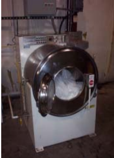
Figure 3. 50 pound Milnor washer/extractor installed at Anovotek, LLC laboratory.

The pilot-scale washer/extractor and chemical addition system has the following basic specifications: