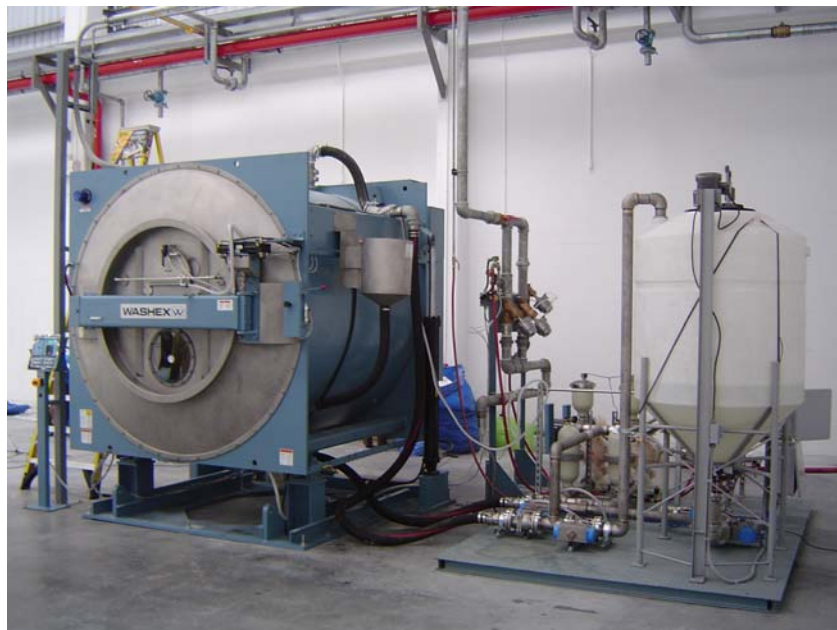
Figure 6. LLIN Chemical Feed System engineered, built and integrated into Washex DPM 5000 washer/extractor by Texchine, Inc.